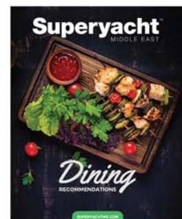
Created by Superyacht Middle East™